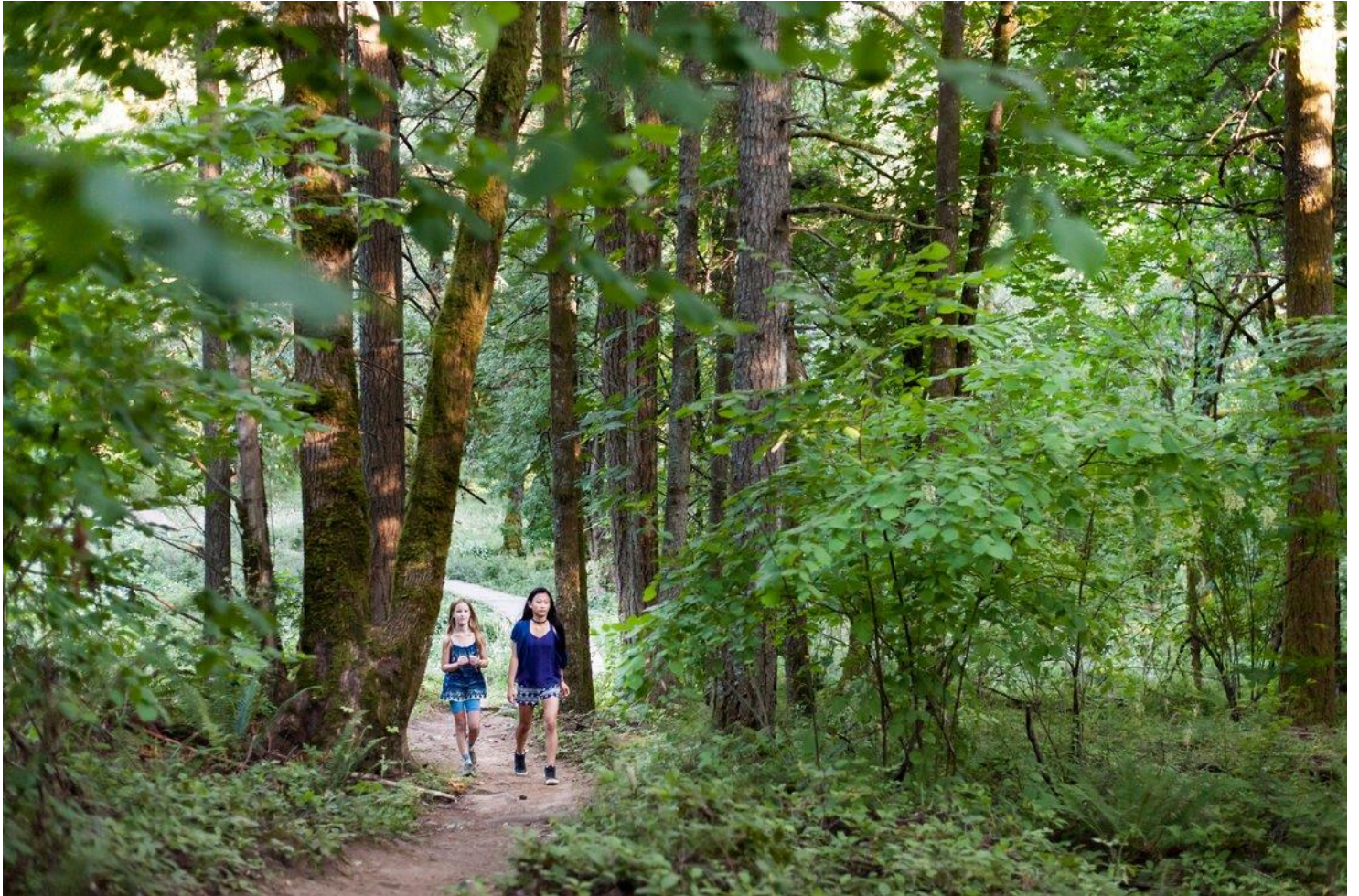
Photo (above): Two hikers enjoying Mt. Talbert Nature Park.